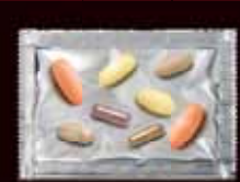
DIETARY SUPPLEMENT 30 PAKS